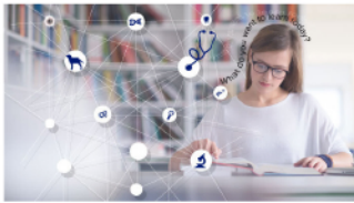
Course Resource List

Mobile friendly and packed with student-specific information and resources to help you study for exams and think like a clinician, features 15 RESOURCES we know students use frequently and find helpful. Some of these are: